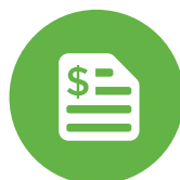
ALL ON 1 BILL