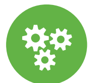
PARTS & LABOUR